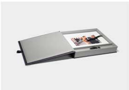
MEMORY BOX WITH 10 IMAGES & USB