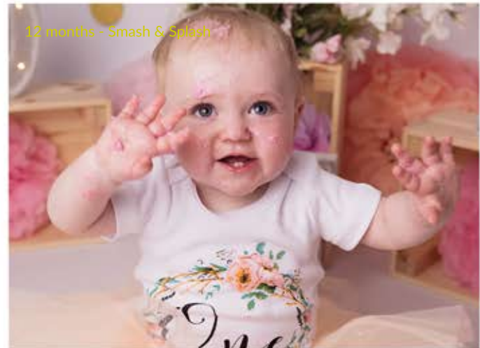
12 months - Smash & Splash